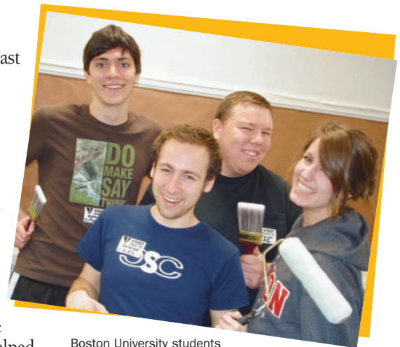
Boston University students

The Boston University Alternative Spring Breaks program has been dispatching students throughout the United States since 1987, and has helped the Open Arms Youth Project (OAYP) located here in Tulsa for the past three years. It is through the support of the OAYP, that this year's students were able to